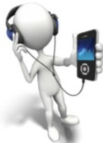
Auto Dealer Sample